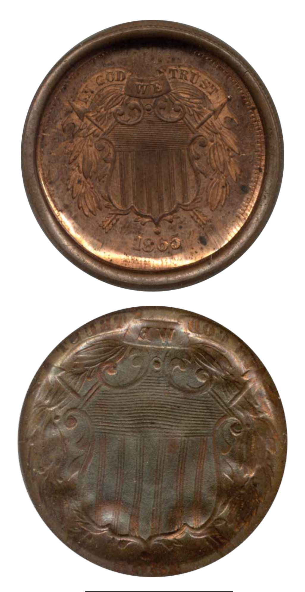
Page 19 minterrornews.com