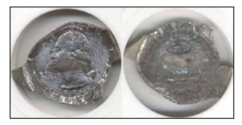
1998 Washington Quarter on Aluminum Feeder Finger Tip

I sold some of these aluminum coins that were struck on feeder finger tips to mint error collectors and to other error dealers. You will find a few of these in their inventory. I kept some of the largest and most dramatic pieces for myself and they are not for sale. I will have a few of these displayed in my showcases at future coin shows.