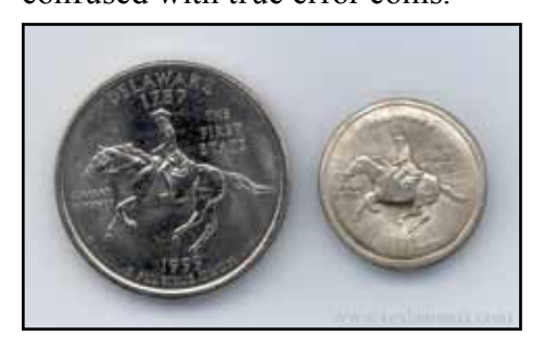
Are there any shrunken error coins?

Shrunken coins are genuine coins that have been reduced to 65-95% of their original diameter using huge magnetic fields. Over the last year, we began offering shrunken coins as educational, scientific, and coin collecting novelties. A significant number of these are now in the hands of experimenters and collectors throughout the world. Shrunken coins have been featured in Coin World (November 25, 2002) and in the January-March, 2003 issue of Extraordinary Technology magazine. This article will briefly explain how these unique coins are produced and how they can be recognized so that they won't be confused with true error coins.