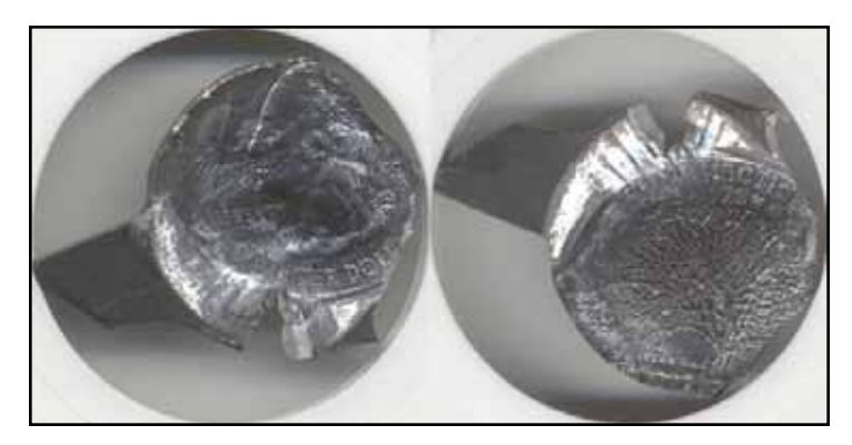
1999 CT Quarter on Aluminum Feeder Finger Tip