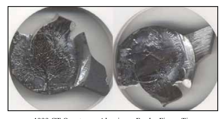
1999 CT Quarter on Aluminum Feeder Finger Tip