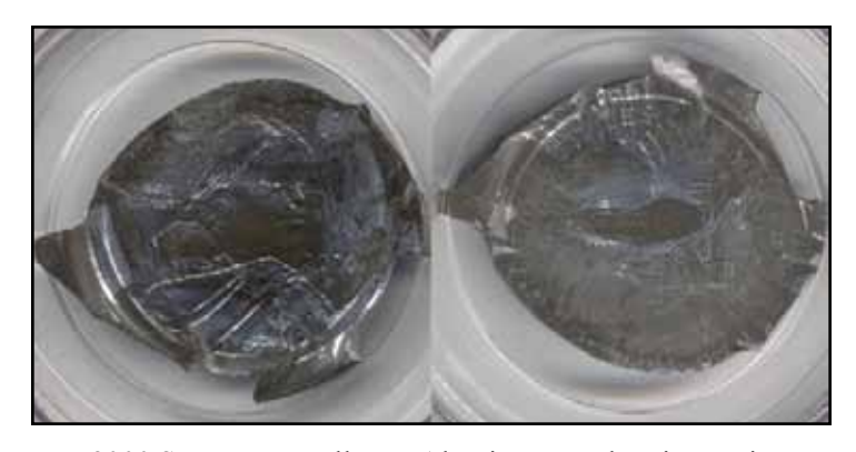
2000 Sacagawea Dollar on Aluminum Feeder Finger Tip