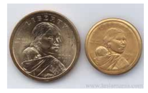
Need more information?

Other coins, such as this Sacagawea dollar, show a minimum of feature shifting and Luders lines.